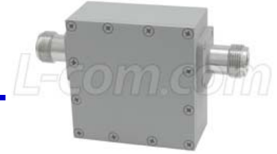
Outdoor Model: BPF900A