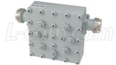
Indoor Model: BPF900