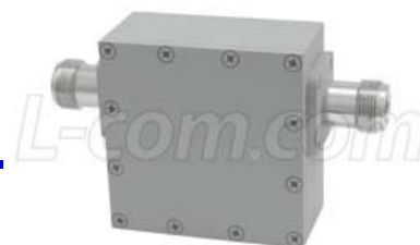
Outdoor Model: BPF900A