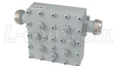
Indoor Model: BPF900