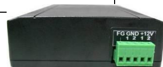
Back panel view