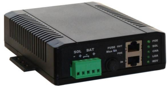
TP-SCPOE-2424-HP Charge Controller